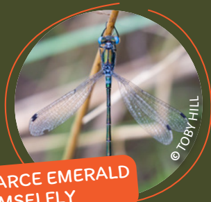
SCARCE EMERALD DAMSELFLY

Scarce emerald damselflies bred at Hertford Heath Nature Reserve. These are a rare and vulnerable species mainly confined to Essex and North Kent.