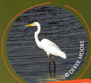
GREAT WHITE EGRET